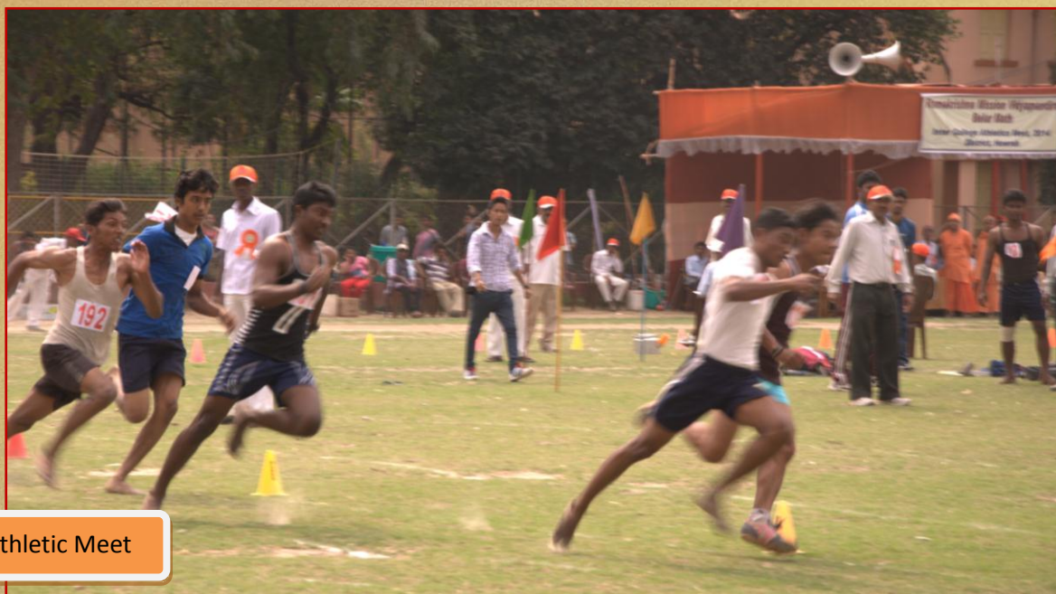
District Level Athletic Meet