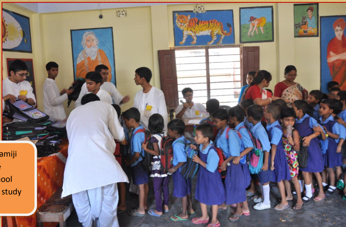
Students of Swamiji Work Circle are distributing school bags and other study materials