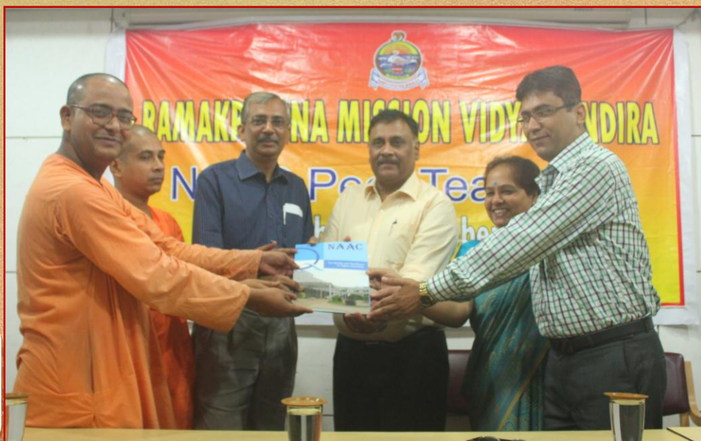
NAAC Peer Team Report Handing Over Ceremony