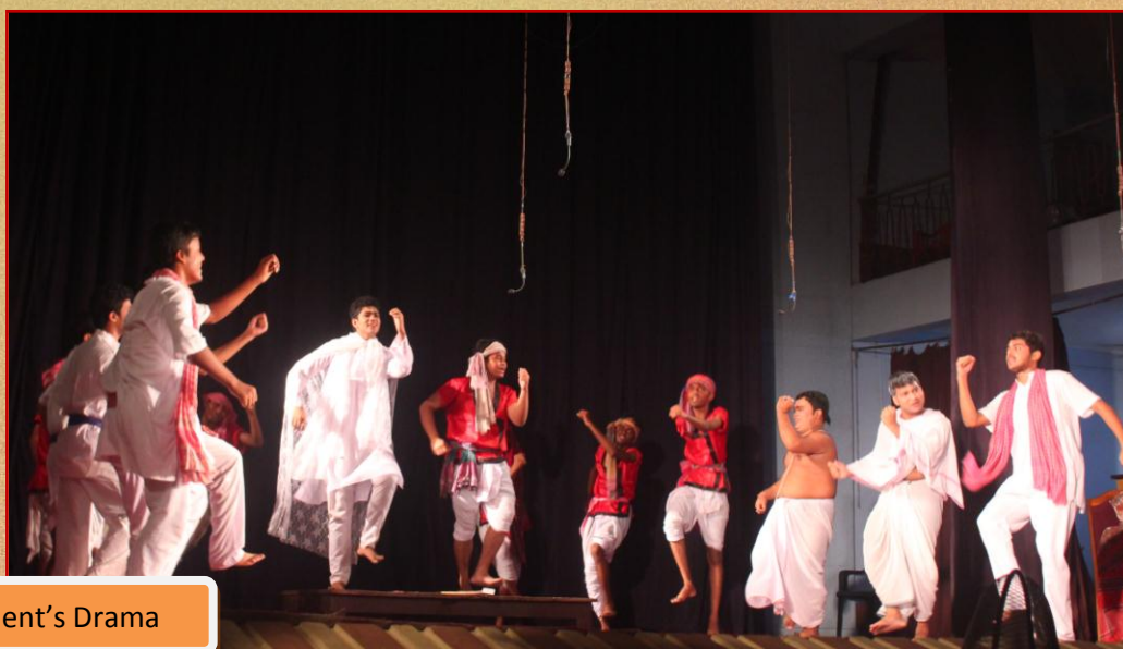
Cultural Activity: Student's Drama